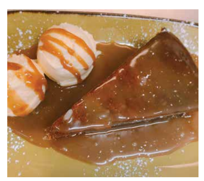
Sticky Date Pudding

Deep fried Ice Cream $8.00 Banana Fritter with Ice Cream $8.00 Banana Split with Ice Cream $8.00 Sticky Date Pudding $12.00 Plain Ice Cream $4.50 Lychees with Ice Cream $8.00