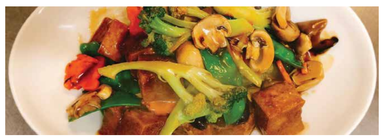
Fried Bean Curd with Mushrooms and Vegetables

Fried Bean Curd with Mushrooms & Vegetables $20.00