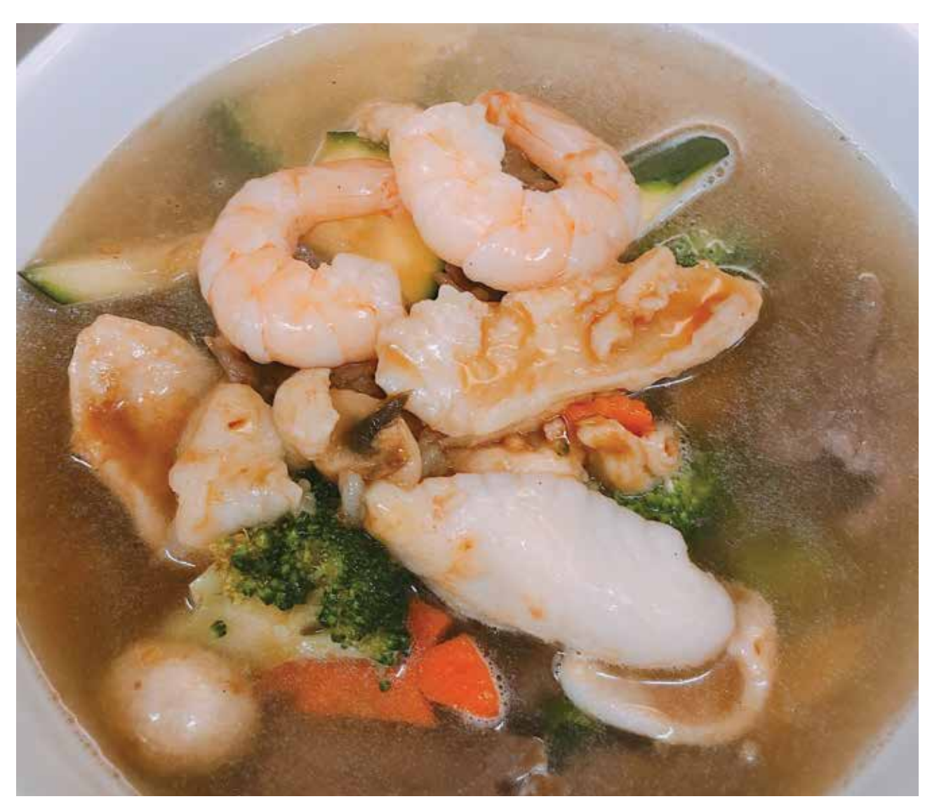
Combination Short Soup (Main Meal)