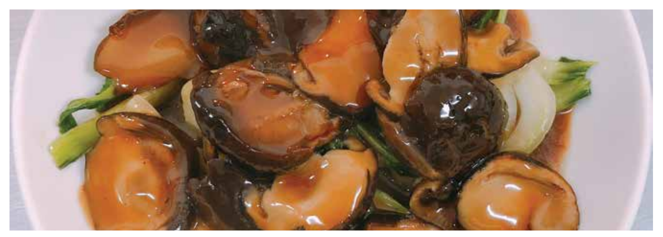
Chinese Shanghai Pak Choy