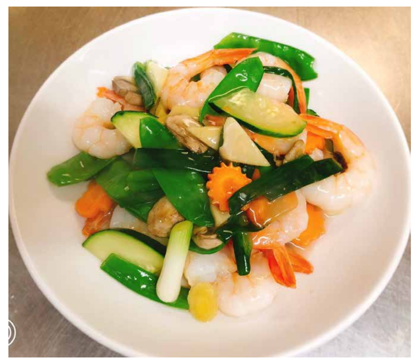
King Prawn Ginger and Shallot