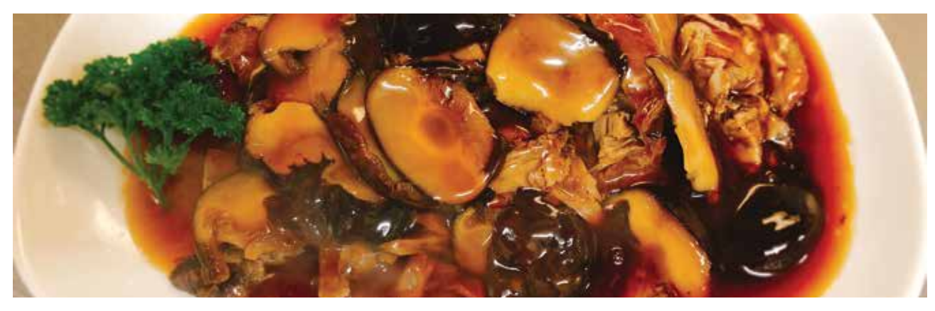
Steamed Duck with Chinese Mushroom Sauce