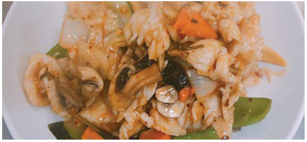
Chicken Fillets with Chilli Basil & a Touch of Citrus Sauce