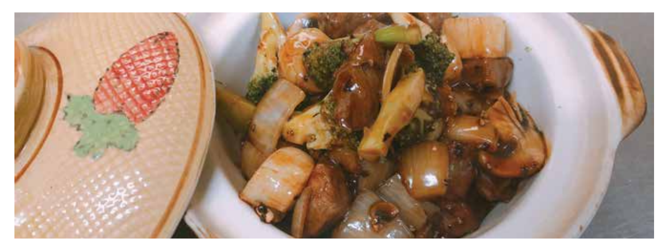
Pepper Sauce Beef Steak & Scallops Hot Pot