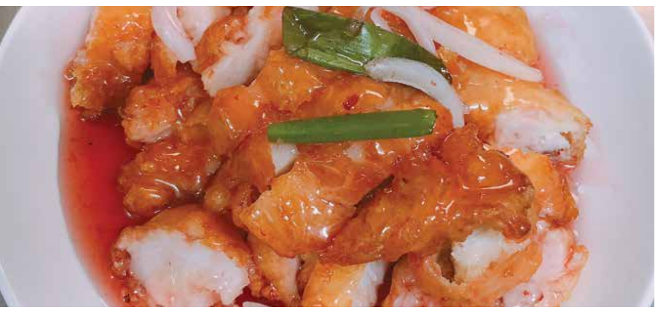
Deboned Chicken Breast (Plum)

Chicken Fillets (Sate, Sichuan, Curry) $21.00